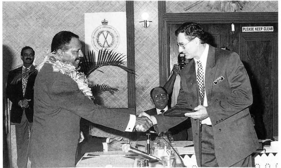
The conference was officially opened by the Prime Minister of the Republic of Fiji, Hon. Major General Sitiveni Rabuka. He was presented with the conference plaque by Commissioner Palmer on behalf of the conference delegates.

Commissioner Savua stated the safety and security of the population of the region was dependent upon the increasing need for continuous improvement in mutually beneficial relationships between all law enforcement agencies. A decision by the Australian Federal Police to review the operation of its international liaison network to enhance its value to the region was a direct response.