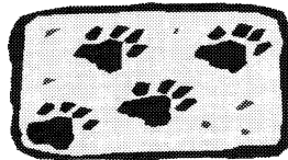
Tracking the bow tie

The Sydney search for the missing black bow tie is continuing.