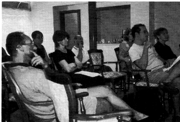
Alice Springs practitioners attended GST workshops on 17 & 18 March 2000