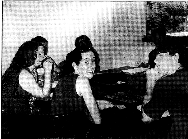
One of the groups preparing their workshop reports at the Darwin Youth Challenge held on 5 April 2001