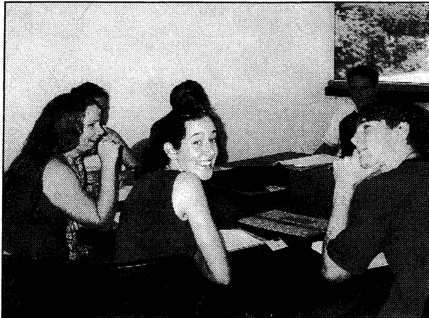
One of the groups preparing their workshop reports at the Darwin Youth Challenge held on 5 April 2001