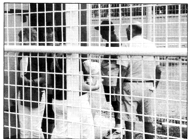
Tour participants experiencing the solitary confinement quarters where mentally disabled people were often kept at the Gaol