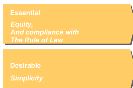
FIGURE 4: STAGE 3 - ADMINISTRATION

Under stage three, it is very important that a tax is able to be administered equitably, in compliance with the Rule of Law. The goal of administrative simplicity is of secondary importance. This is because, arguably, administrative costs are already minimised significantly under a self assessment system and, therefore, it is more important in such a system to pursue the goals of certainty and equity. However, where the tax is certain it is likely to also be capable of being administered cost effectively and therefore, where certainty is pursued it is likely that administrative costs will be minimised.