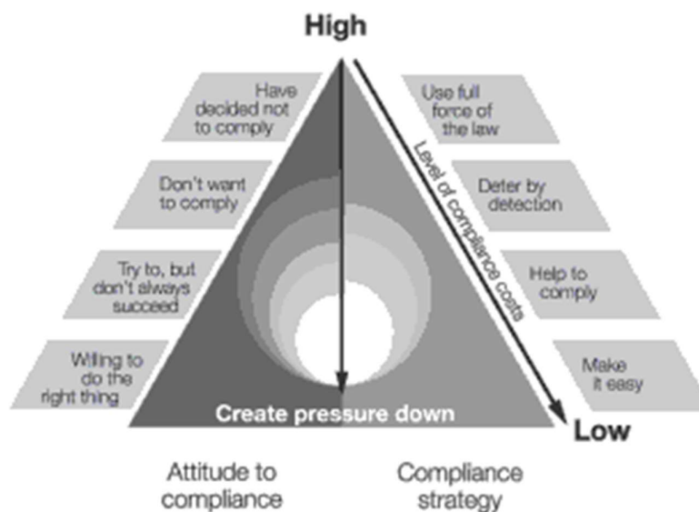
Fig. 1: Regulatory Pyramid

Enforcement strategies become progressively firmer going up the pyramid. The objective is to guide voluntary tax compliance among the majority of taxpayers and to reduce, as far as possible, the number of people who require enforced compliance, while ensuring collection systems are effective and not reducing tax morale (Braithwaite & Wenzel, 2008). Ahmed and Braithwaite have characterised the approach towards the bottom of the pyramid as 'dialogic', with tax administrators aiming to create a genuine change of beliefs in small business taxpayers about the tax system, what it represents and what it provides the community (Ahmed & Braithwaite, p. 556).